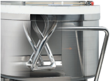
双螺旋搅拌工具 Double tool system