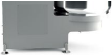
带底部出料装 Bottom Discharge System

底部出料装置可以直接将面团输送至生产线，可选配延伸输送带让面团得到充分的松弛；和面机特别注重食品安全和性能；和面缸恒速转动有利于提高面团质量，相对于传统的齿轮传动方式，降低维护需求，更加经久耐用。