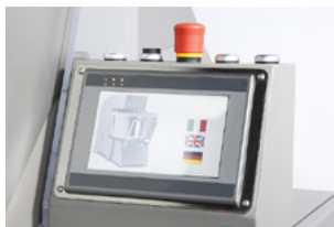
触控面板（选项） Touch screen (option)