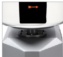
建设可靠重型 Reliable heavy-duty construction