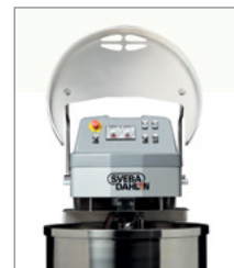
建设人性 Ergonomic construction